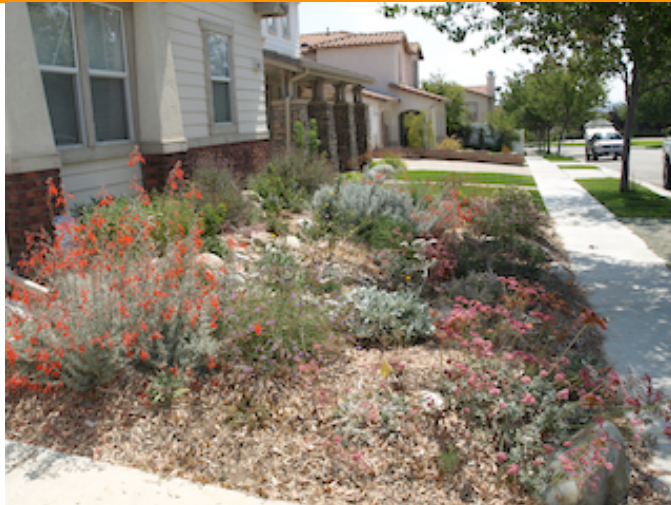
8 months later: only used rainwater – tapped into soil sponge

Save water, prevent runoff and flooding, have more time & money for other things. How? Ocean Friendly Gardens “apply CPR to revive our watersheds and oceans:”